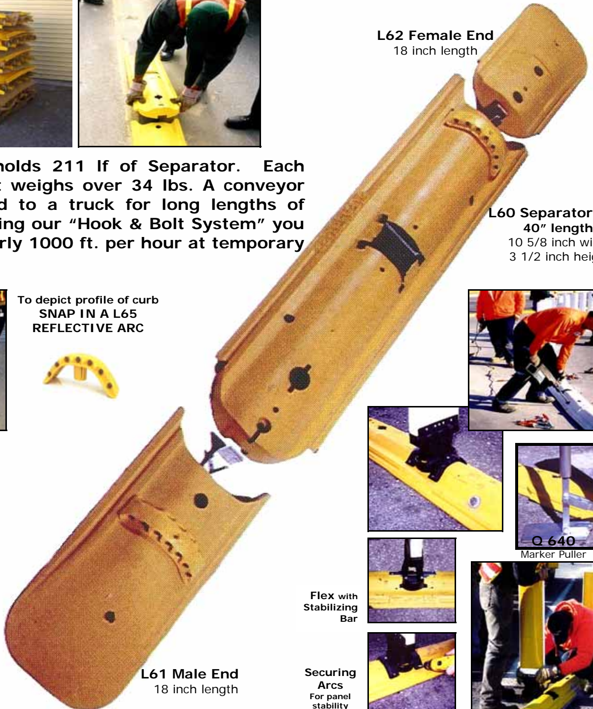
L61 Male End 18 inch length