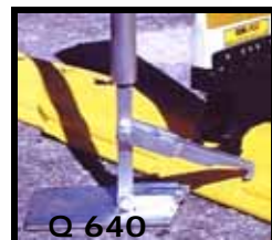
Q 640 Marker Puller