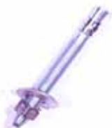
FS 51 Anchor Wedge Concrete