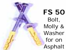
FS 50 Bolt, Molly & Washer for on Asphalt