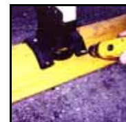
Securing Arcs For panel stability